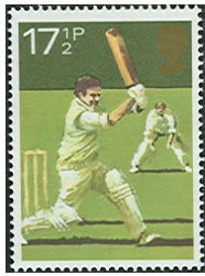
Celebrating 100 years of cricket rivalry

Ralph Wyndham included this cricket stamp for me to use with his 'Cricket' article if I wished to. The stamp celebrates 100 years of what later became known as test cricket. The rivalry began between England and Australia in the 1876-77 season.