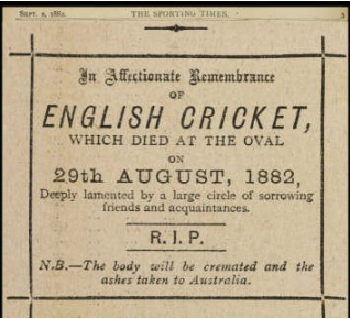
An obituary for English cricket in

Test cricket is considered to be the highest level of international cricket playing. It is essentially a regularly fought cricket battle between two countries. Five matches are usually played over five days at different locations. The series is played biennially and the countries alternate as hosts. In 1882 Australia won their first test match on British soil. The British loss was ridiculed by the press. The bottom line of this 'obituary' for English cricket in 'The Sporting Times' notes that "The body will be cremated and the ashes taken to Australia." Ivo Bligh, the captain of the English team, vowed to regain 'the ashes' on the team's next foray to